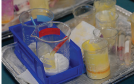
Chemicals before & after a reaction

LEGO Chemistry is an introduction to chemistry in two parts: the Wet Lab, in which students learn proper lab technique as they observe chemicals throughout a chemical reaction, and the LEGO Lab, revisiting the reaction using LEGO bricks to model the elements. Ages 11 and up