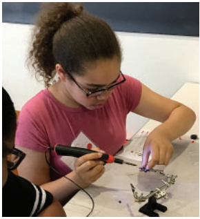
An introduction to soldering.

(These two sessions available via Remote Instruction as well as In-Person)