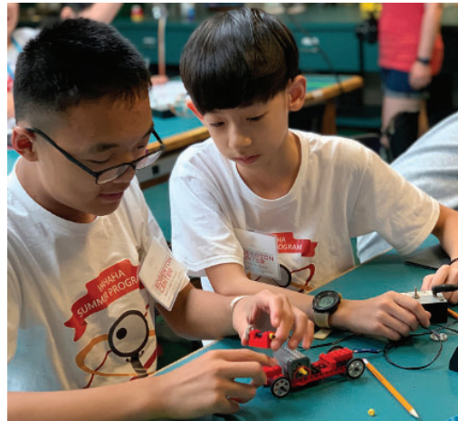
Building a LEGO car

Pairs of students are challenged to build a slow car after being introduced to the concepts of gearing down and gear ratios. Students are encouraged to modify and alter their design throughout the lesson. This activity provides students with a hands-on, mechanical engineering design experience. Ages 9 and up